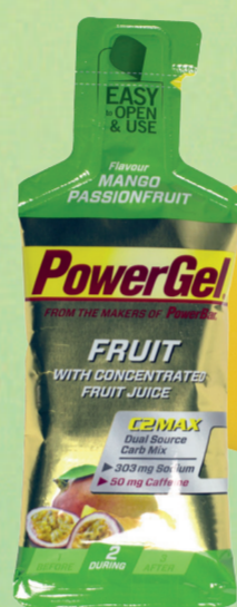
PowerBar PowerGel Fruit Mango Passionfruit 41 g