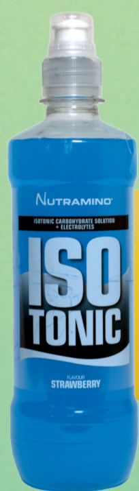
Nutramino Iso Tonic Sports Drink Blue Strawberry 500 ml