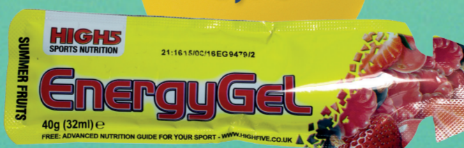
High5 EnergyGel Summer Fruits 40 g