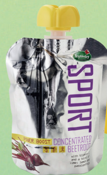
Rynkeby Sport Power Boost Concentrated Beetroot 70 ml