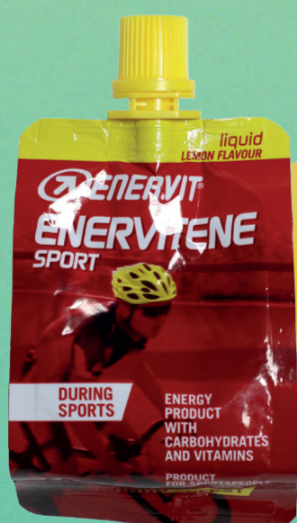
Enervit Enervitene Sport Cheerpak Lemon Flavour 60 ml