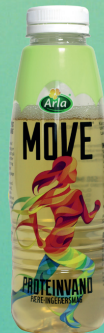
Arla Move Proteinvand pære-ingefærsmag 500 ml