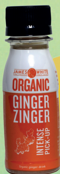
James White Organic Ginger Zinger 70 ml